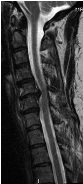
Figure 2. Sagittal view shows retrolisthesis of C5 on C6 with the large disc herniation as seen on axial view in Figure 1. The spinal cord is contacted by the herniated disc