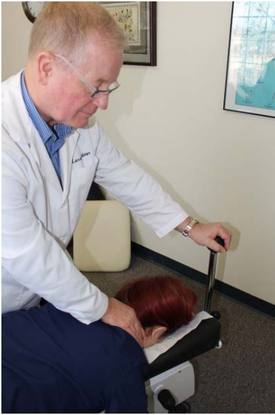
Figure 4. Close up of contact.