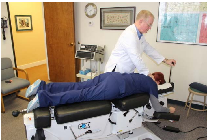
Figure 3. Cox Technic long-y axis decompression spinal manipulation is applied to the C5-6 segment.

Treatment consisted of Cox® Cervical Flexion-Distraction Decompression Technic using Protocol 1 at a frequency of 3 visits per week for the first two weeks. Protocol 1 is used for gentle specific level treatment in patients who have radiculopathy, in this case such that extends below the elbow. In Protocol 1, the physician grasps the spinous process of the vertebra above the herniation, in this case C5, and decompresses the C5-6 segment using the long-y feature of The Cox®8 Table. (See Figures 3 and 4.) Ultrasound was applied in office. The patient was asked to use ice applications for about 15 minutes every hour or two. She was instructed to maintain neutral spine postures for all activities of daily living. She also used a home traction unit with 10 pound weight when she had significant discomfort at home.