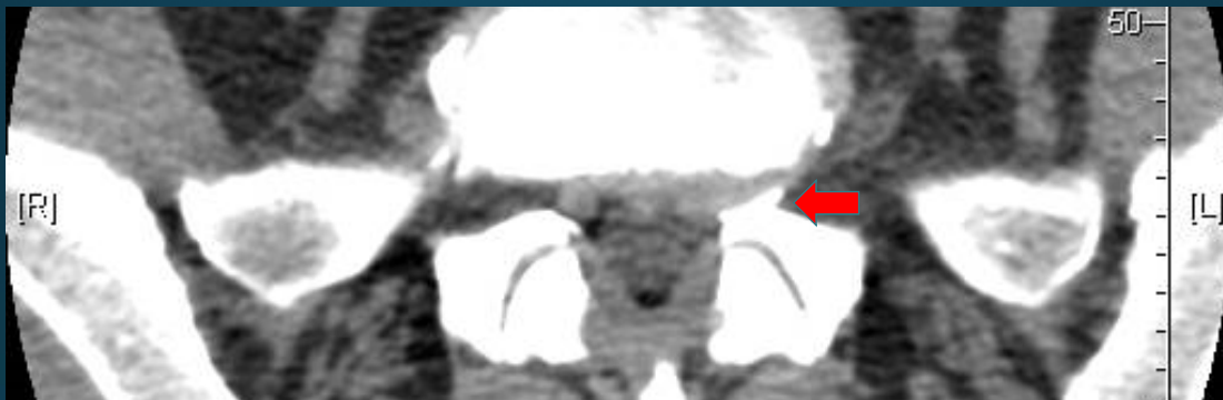
Axial CT of L5-S1