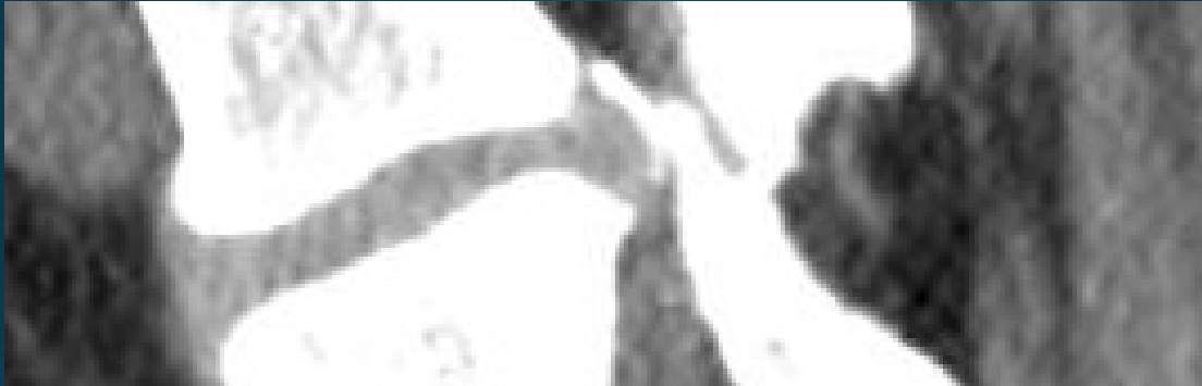
Sagittal CT of L5